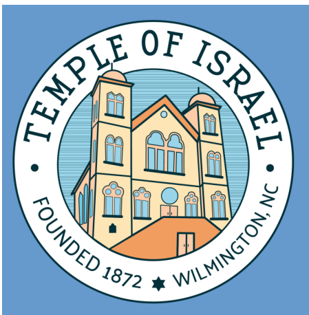
Temple of Israel

Here’s to a happy and healthy New Year filled with gratitude and shalom!