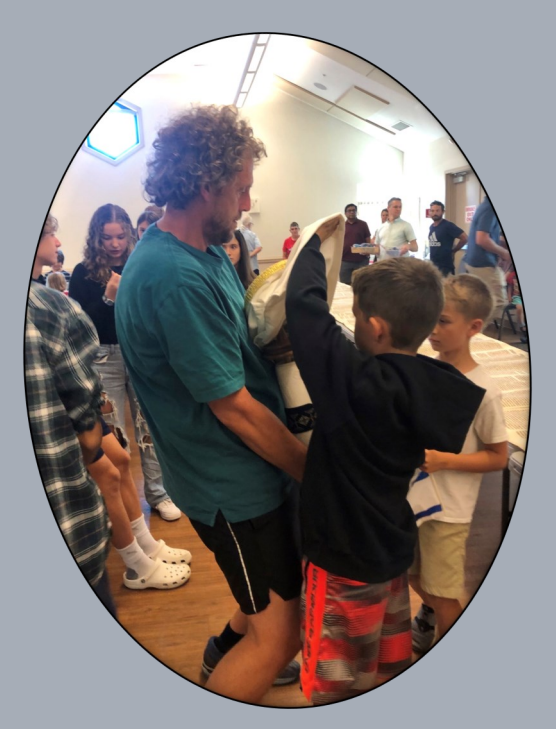
Simchat Torah Celebration